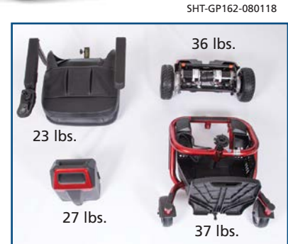
Perfect for transport!

Some accessories require a mounting bracket or mounting clips.