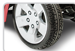
13" Low-profile Tires