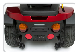
Full lighting package

PRIDE® MOBILITY SCOOTERS LIVE YOUR BEST®